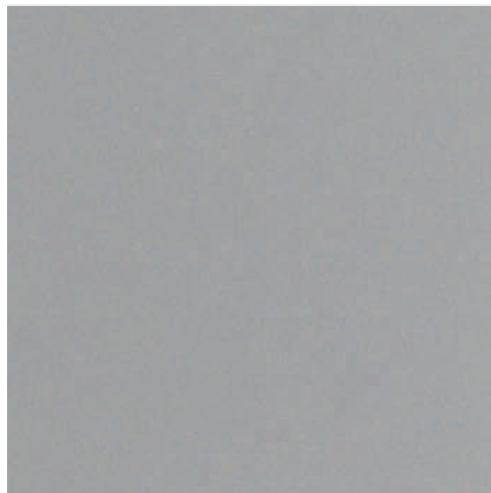
Xtreme™ Champagne Fluoraset® X25