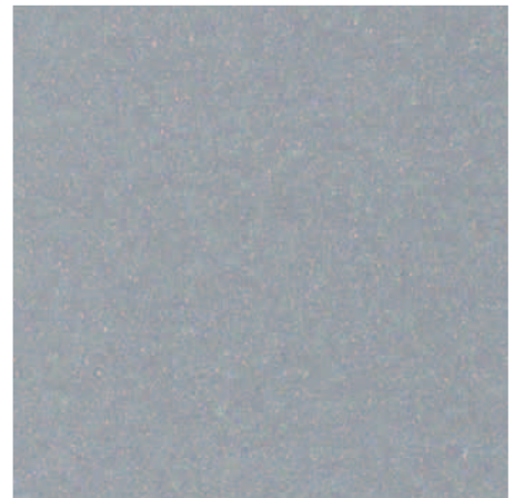
Xtreme™ Silver Fluoraset® X25