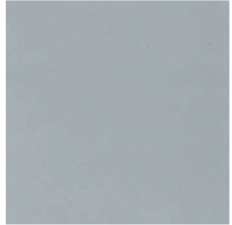
Xtreme™ Coin Fluoraset® X25