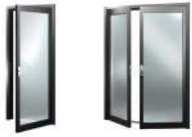
Single door French doors