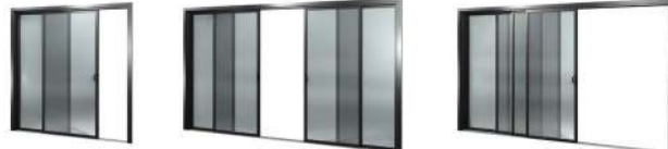
Single slider Double slider Stacking slider